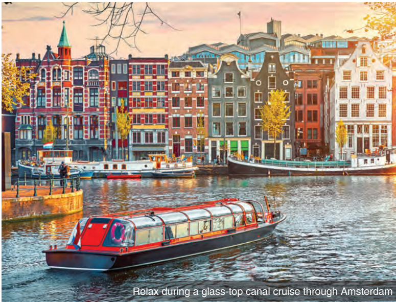
Relax during a glass-top canal cruise through Amsterdam

DAY 10 Koblenz: Begin the day sailing through the spectacular UNESCO World Heritage Rhine Gorge. Pass countless medieval castles and vineyards lining the shores of this section of the river, with photo opportunities around every bend. See the infamous Lorelei statue and Pfalzgrafenstein Castle, built on an island in the middle of the river as a medieval toll station. Continue cruising to the 2000-year-old town of Koblenz, situated at the confluence of the Rhine and Moselle Rivers. Enjoy a walking tour through the streets of the city as your guide points out historic monuments and buildings. See the 'German Corner' monument marking the confluence of the Rhine and Moselle Rivers. Panoramic views await from the visit to Ehrenbreitstein Fortress, reached by cable car, crossing the river! This evening, attend a private concert as part of the EmeraldPLUS program. Meals: B, L, D