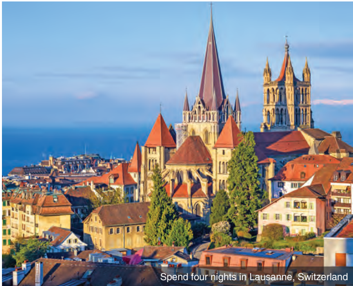
Spend four nights in Lausanne, Switzerland