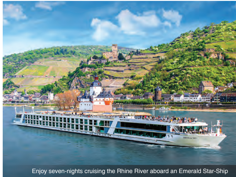
Enjoy seven-nights cruising the Rhine River aboard an Emerald Star-Ship

DAY 1 Depart the USA: Depart the USA on your overnight flight to Geneva, Switzerland.